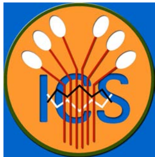
International Complement Society