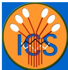
International Complement Society